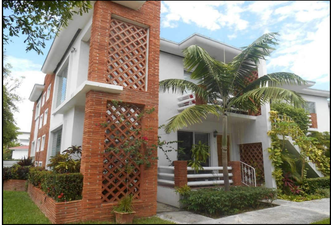
Figure 2.1: A mid-century modern apartment building at 1025 93 rd Street.