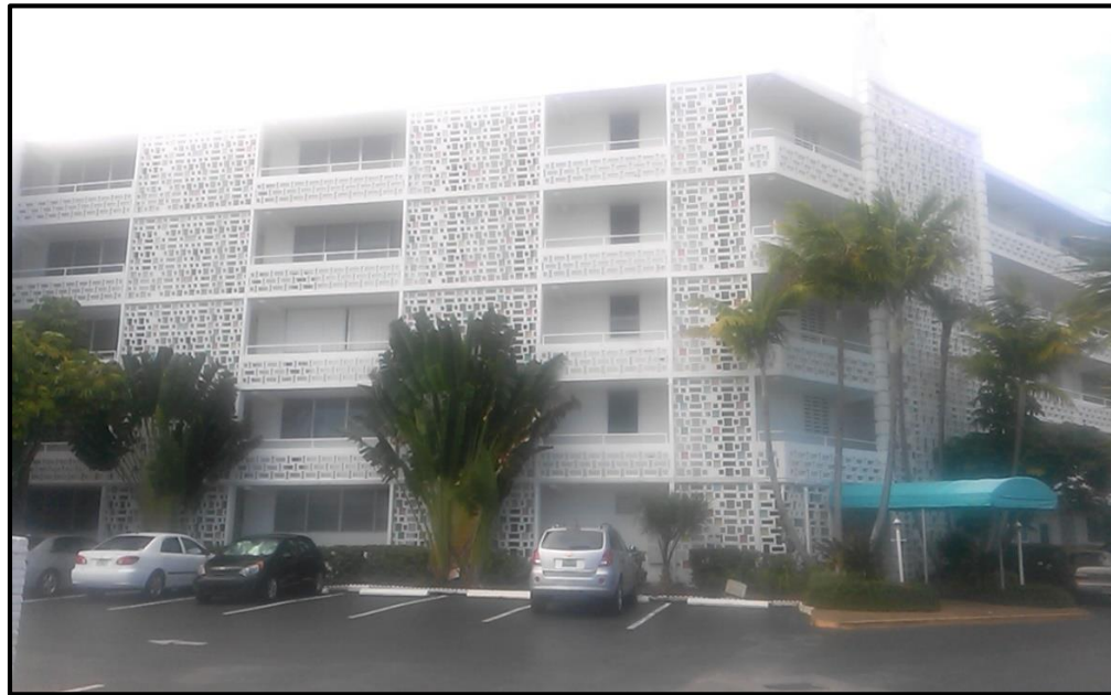
Figure 2.2: Bay Harbor Continental condominium at 1135 103 rd Street. In 2010, the Miami-Dade County Office of Historic Preservation attempted to designate this building as an individual resource.